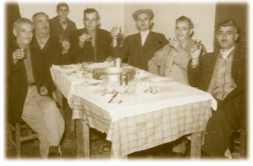
The Koikas family and friends. Greece - 1940s